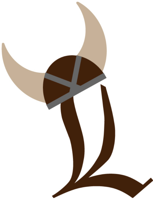
by BrookLyn Prisbrey